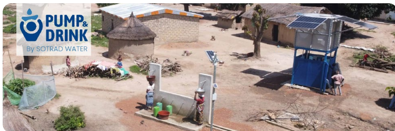
Figure 1: An example of a drinking water system in a rural setting.